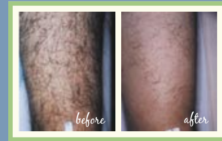
Man's leg after just two treatments.

A faster, safer way to remove hair of all colors and textures, this cutting-edge technology emits gentle pulses of energy. Reduce potentially harmful side effects by treating the target area only, not surrounding tissue.