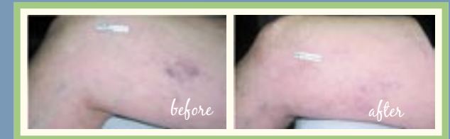
Leg veins significantly reduced after just three treatments.

The average laser vein procedure at Good Health Rejuvenation takes less than 30 minutes to perform and coupled with our unique cooling device, provides safe and beautiful results. Imagine returning to work and daily activities immediately after treatment.